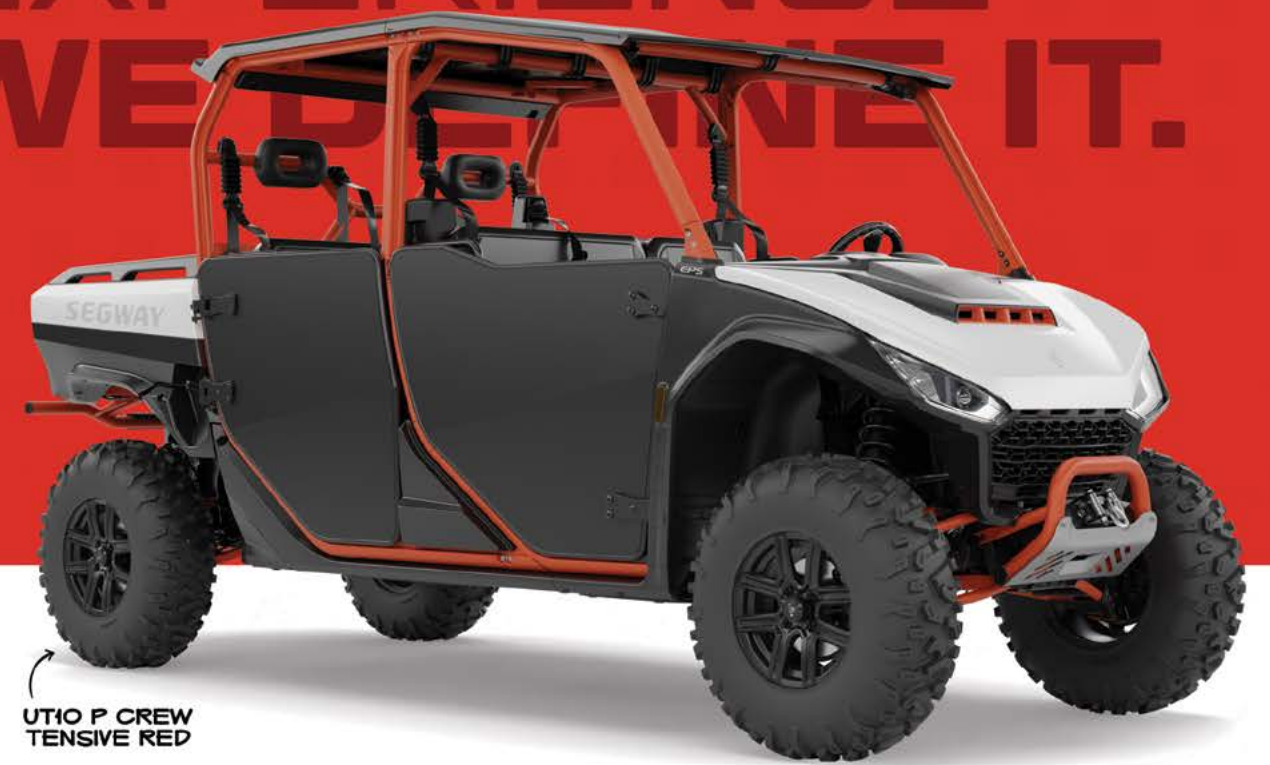
UT10 P CREW TENSIVE RED

WE DON'T JUST DELIVER THE ULTIMATE RIDING EXPERIENCE - WE DEFINE IT.